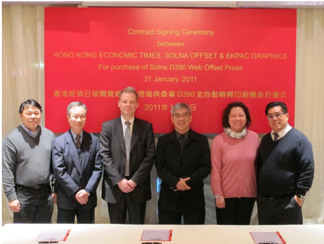
Contract signing ceremony in Hong Kong the 31 st of January 2011. Representatives from HKET, Ekpac Graphics Ltd. and Solna were present.